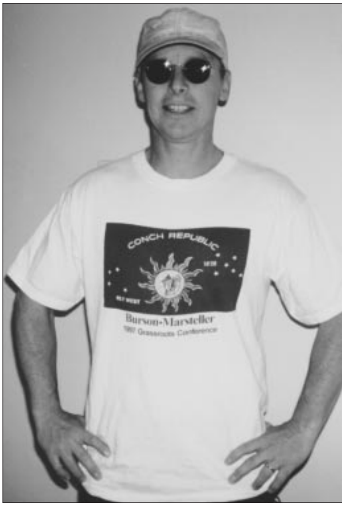
We covered the Public Affairs Council's "National Grassroots Conference" in February, and all we got was this lousy T-shirt—plus an insider's view of how corporate America manages and manipulates grassroots democracy.

The relaxed atmosphere made an odd counterpoint to the deadly serious themes under discussion. The assembled corporate ambassadors made it clear that the current challenges of "managing public opinion" while "maintaining market share" is a risky business indeed.