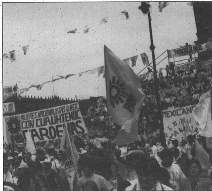
An election campaign rally for the PRD, leftist opponents of the Partido Revolucionario Institucional (PRI), Mexico's governing party.

The 1994 elections were an important focus of the PRI's image-building campaign. A fundraising banquet for the PRI last year drew Mexico's 25 richest men,