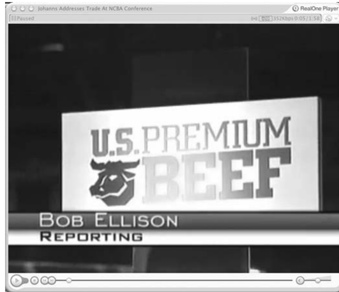
USDA video news release

In the short term, USDA-produced "news" will continue to infiltrate the airwaves, without disclosures. VNR producers are scrambling to do damage control and fight back against the effort to stop fake news. But as public awareness grows, so does the pressure for real news. ■