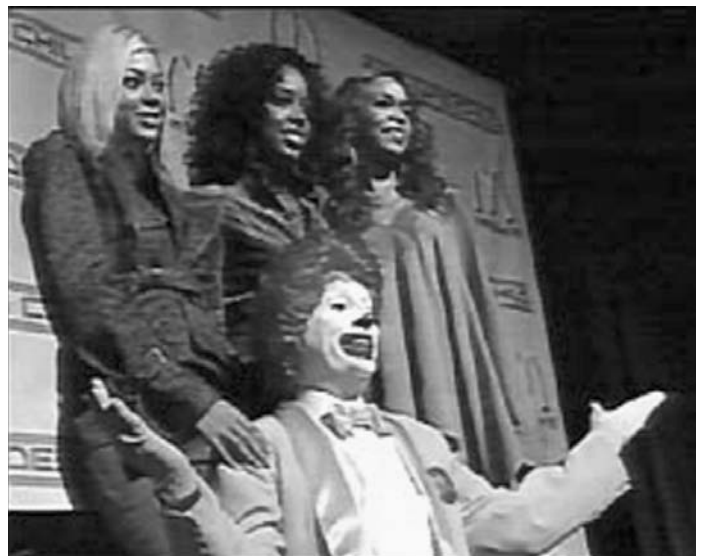
Still shot from a McDonald’s video news release featuring the Destiny’s Child singing group.

Video news releases, known as VNRs, typically come packaged with two versions of the story the PR firm is trying to promote. The first version is