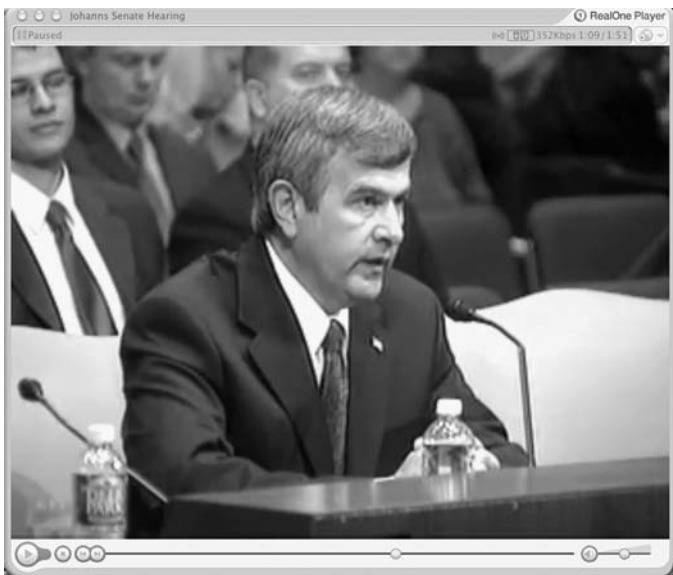
Agriculture Secretary Mike Johanns in USDA video news release.

Beef trade between the United States and Canada has also been restricted—by the United States, this time—since the first BSE-infected Canadian cow was discovered in May 2003. The TV segment shows Johanns warning, with regard to U.S.-Canadian negotiations, "If we just tangle trade up in any way that isn't based upon risk analysis and science and all of the things I've talked about, then where's our protection with another country? Devastating trade is devastating to agriculture."