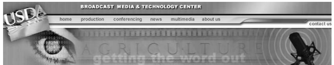
USDA’s Broadcast Media & Technology Center website banner

As might be expected, BMTC’s coverage of CAFTA tends to repeat Bush administration talking points. What’s more notable is their faint nod to some opponents of the trade agreement, which effectively defines, limits and refutes the “other side.”