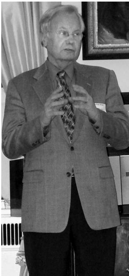
Bill Moyers speaks to guests.